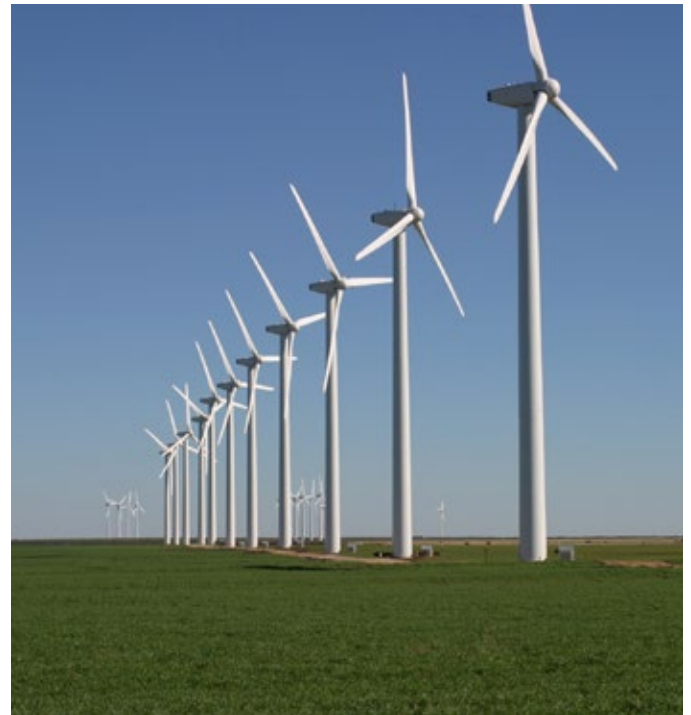
Wind and solar power are winning the battle with fossil fuels on straight economic grounds!

The electric utilities are keeping the PSC and us busy by filing frequent rate increase cases. Great Rivers represents Renew Missouri , NRDC and the Sierra Club in challenging their attempts to raise the fixed charge on residential customers, since a higher fixed charge, which is beyond the customer's control, is a disincentive to save energy.