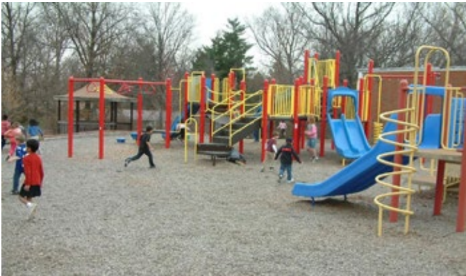
Your donations helped citizens in Olivette, MO, preserve beloved Warson Park.