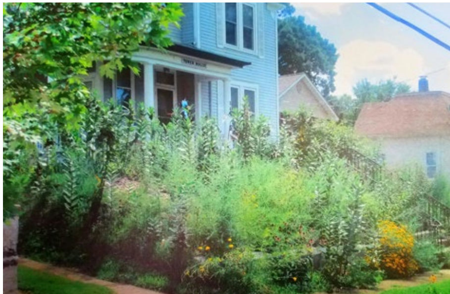
This is the garden of Alice Hezel. The City of Maplewood has issued her citations over the vegetation.

Native plants offer habitat for the endangered monarch butterfly and use less fossil fuels for their upkeep than does grass.